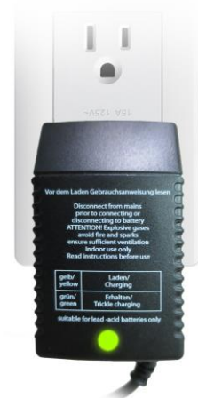
Green indicates charging complete