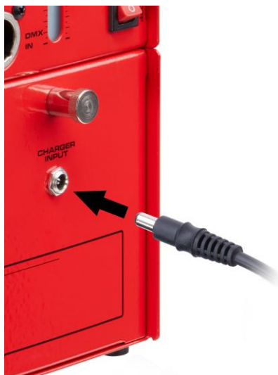
Plug in the charger

Step 3: Charge the battery by plugging the charger adaptor into a grounded electrical outlet. Yellow light on the adaptor indicates charging, when it turns green then the charge complete. Please note the battery requires 15 hours charge time.