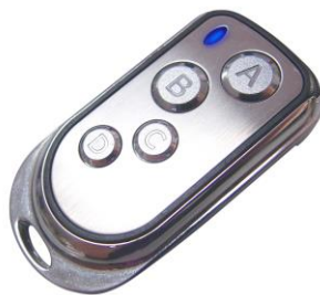
W-2 Wireless Transmitter

Wireless remote control system WTR-20 consists of a transmitter equipped with four buttons to activate, deactivate, increase and decrease fog output and an onboard receiver attached to the rear panel of FT-20 fog machine.