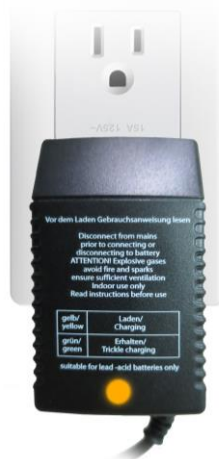
Yellow indicates charging